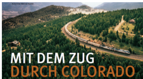
A page from the 2008 Colorado International Holiday Guide.

"People are interested in wide open spaces," Jung said. The natural beauty draws them, as do the Native American cultures, Old West history and adventure — the rafting, hiking, fishing and the allure of the region's